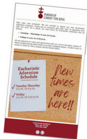
New Eucharist Adoration Hours Announced

Utilizing this quantitative insight, Christ the King incorporated a "Eucharistic Revival" into the curation of their data-informed pastoral plan. Recognizing the profound significance of the Eucharist as the "source and summit of our faith" (Catechism of the Catholic Church, 1324), the parish wasted no time in prioritizing it across all facets of parish life.