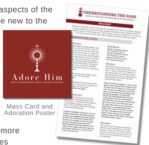
Mass Card and Adoration Poster

Opportunities were crafted to delve into deeper discussions for those more theologically inclined and included topics such as profound experiences and perspectives of saints regarding adoration and the Eucharist.